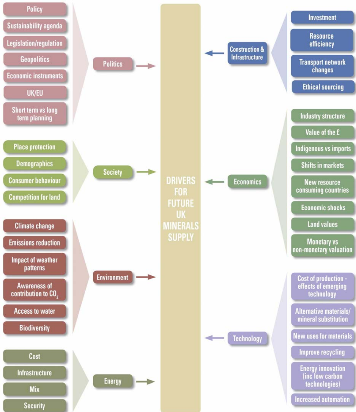
Figure 2. Drivers for future UK minerals supply

Future demand, and thus supply, of the products of the UK minerals industry will continue to be greatly affected by a range of external factors. Seven major factors driving change have been identified from past developments and discussions with the minerals industry (Figure 2). Most of these drivers are interlinked and within them is a multiplicity of other factors, all of which will have an impact to a greater or lesser extent.